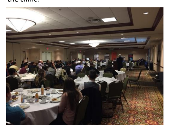
Figure 2: Over 100 participants were in attendance for the ORVC Fall symposium this year

The afternoon was filled with talks sharing research and clinical experience. Guest speakers included Jun Deng presenting deep learning with big health data for early cancer detection and prevention, Anil Sethi sharing his experience with clinical implementation of SRS and SBRT, and concluded with Quan Chen's call to the chapter for engagement with the community in promoting radiation therapy and professional medical physics.